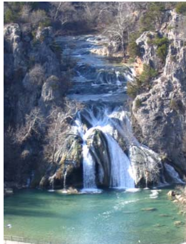
Turner Falls in Davis - Arkansas Mtn. Association

We obtained the marketing plans for each MCO and performed tests to ensure they included the elements specified above. All plans were complete with the exception of five MCOs which did not include evaluative measures. OTRD personnel stated the intent of the performance measures is for the MCO to assess the results of their measures over time and strive for improvement which could lead to increased allocations. Funding to these MCOs was not reduced or eliminated as a result of not providing the required information in their plan. OTRD states they primarily use the marketing plans as a way of knowing the