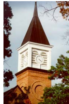
Seminary Hall on the campus of Northeastern State University in Tahlequah – Green Country