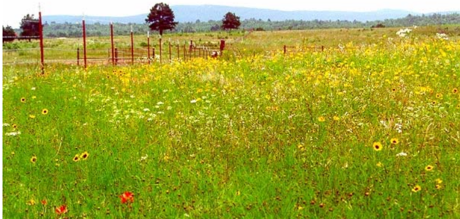
Countryside - Kiamichi Country

Overall, the program appears to be worthy with positive objectives and accomplishments.