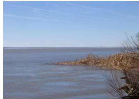
Great Salt Plains Lake - Great Salt Plains Association

The independent audits are necessary and should be a continued requirement of this program; however, as mentioned above, OAC 725:20-7-9 requires each MCO to submit a financial related audit as defined by Government Auditing Standards each fiscal year to OTRD. Government Auditing Standards was revised for periods ending on or after January 1, 2004, and the term "financial related" audit is no longer relevant. OTRD should revise OAC 725:20-7-9 (a) to include the updated guidance of Government Auditing Standards and include language requiring the public accountant or certified public accountant to be registered with the Oklahoma Accountancy Board to perform audits of governmental entities.