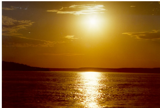
Lake Eufaula-Eufaula Lake Association

OAC 725:20-7-6 (a) and (b) states “(a) Administrative expenditures are made by a MCO for the administration of fund raising to accomplish the association’s tourism promotion objectives. (b) Reimbursement of matching funds for administrative expenditures by an MCO shall not exceed forty percent (40%) of the total expenditures reimbursed with matching funds.”