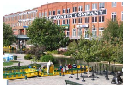
Bricktown in Oklahoma City - Frontier Country

and participating in the matching funds program on July 1, 2001..." This appears to be OTRD's solution for controlling the number of MCOs in the state because if you were not an MCO before this date, you could not become one. Prior to July 2001, it appears OTRD did not consider the need for promotion (is